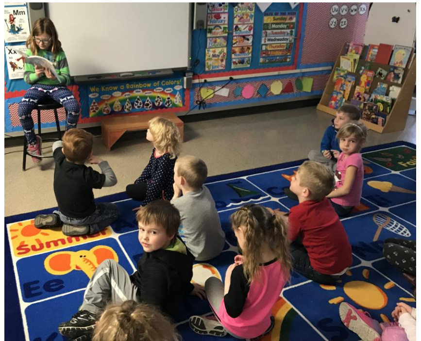
Top left clockwise: Students of the Month, Preschool Alphabet Soup, 4 th grade reading to Prek, WATCH DOG